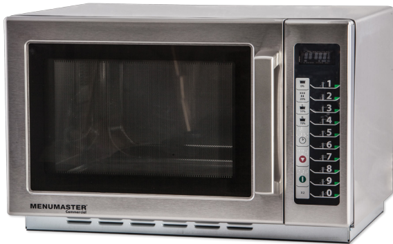
Model RCS511TS shown