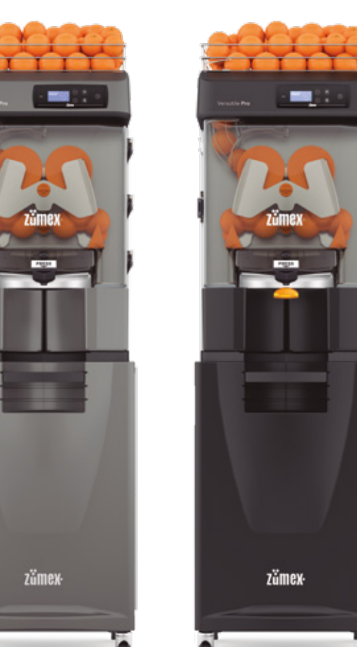
Versatile Pro All-in-One