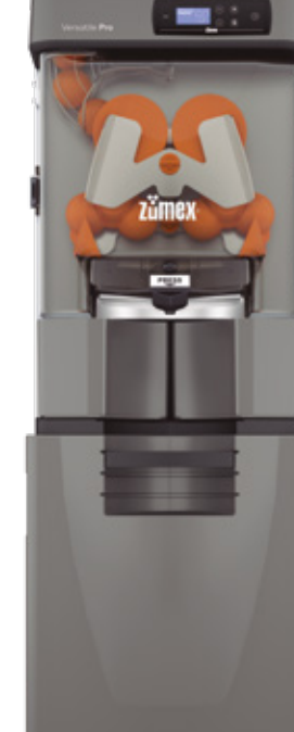
Versatile Pro All-in-One