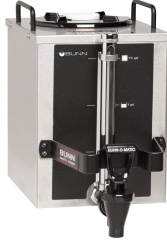
1.5GPR-FF, TOP HNDL