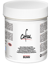
CLEANING TABLETS, CAFIZA 100T