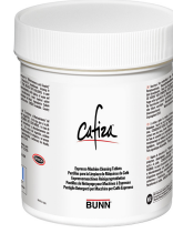
TABLETA PARA LIMPIEZA